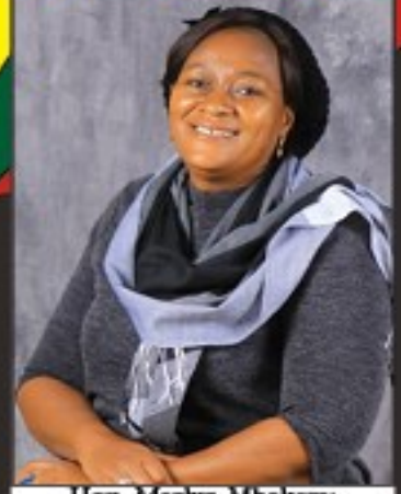
Hon. Mariyn Mbakera: Otjiwarongo Constituency & Chairperson of Otjozondjupa Regional Council