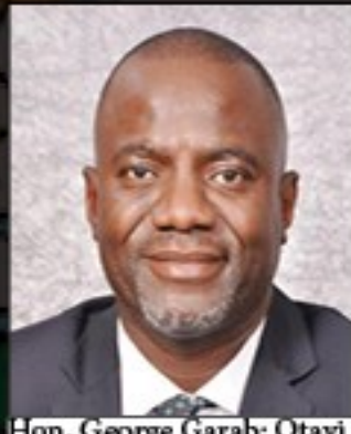
Hon. George Garab: Otavi Constituency