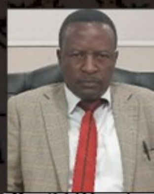
Hon. Abdal Mutjavikua: Okakarara Constituency