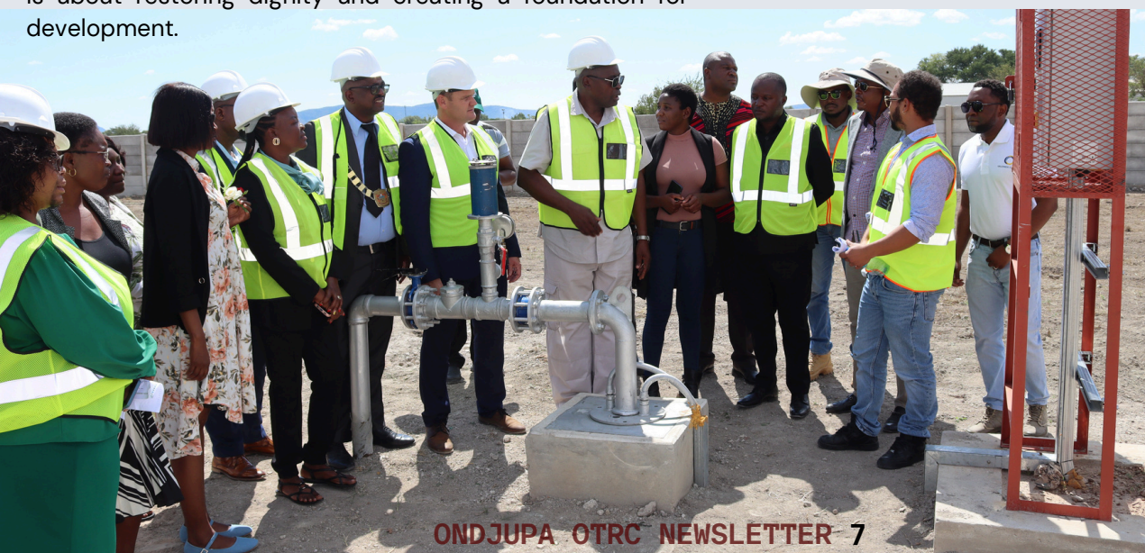
Minister James Sankwasa and Otavi Mayor Isaac !Hoeab inspect the new water infrastructure at the Town

!Hoeab added that the town council pledges to ensure that this investment is protected, maintained, and used to uplift the lives of the town's inhabitant.